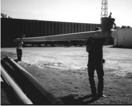
Figure 3 – Two men carry 40' of 8" pipe in Topeka, Kansas

A major advantage to using fiberglass systems during installation is its prefabrication capabilities. Directional changes, cleanout saddles and scupper collectors can be attached and fitted to sections of pipe and then lifted into place. The lightweight and high strength properties are a