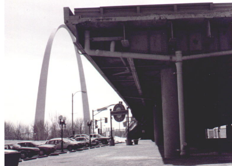
Figure 1 - Interstate 70 St. Louis, MO

The Missouri Department of Transportation (MODOT) visited the Chicago bridge site and admired the FRP bridge drain project. MODOT specified the FRP bridge drain pipe for a very large project on Interstate 70 next to the Gateway Arch in downtown St. Louis. The design called for non-standard pipe fittings, as well as scuppers, cleanouts and other unique equipment. This project was completed in 1984 and still looks like new today. This led to FRP Bridge Drain Pipe becoming a standard for MODOT, and many projects can be witnessed on Missouri's major interstates.